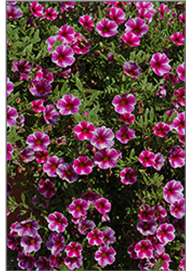
Can-Can Hot Pink Star Calibrachoa flowers

Can-Can Hot Pink Star Calibrachoa is recommended for the following landscape applications;