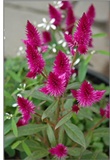
Intenz Classic Celosia flowers

Intenz Classic Celosia is recommended for the following landscape applications;