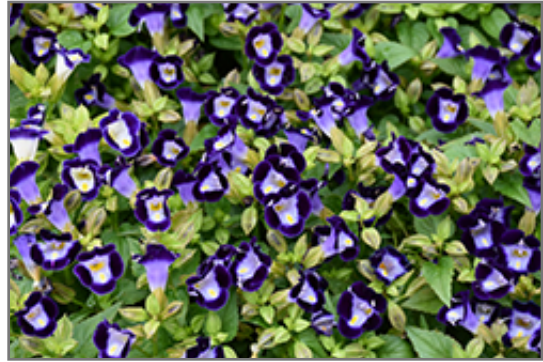
Catalina Midnight Blue Torenia flowers

This plant will require occasional maintenance and upkeep, and should not require much pruning, except when necessary, such as to remove dieback. It is a good choice for attracting bees and hummingbirds to your yard, but is not particularly attractive to deer who tend to leave it alone in favor of tastier treats. It has no significant negative characteristics.