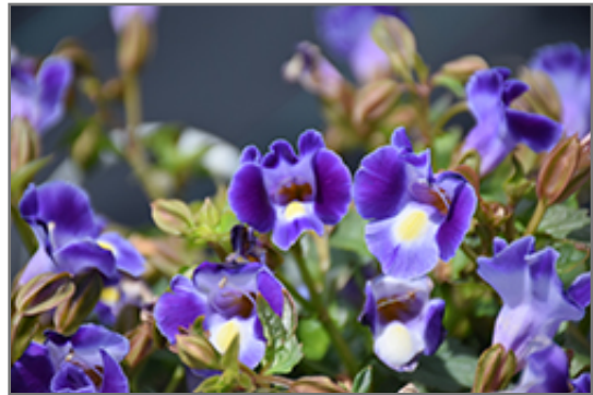
Catalina Midnight Blue Torenia flowers