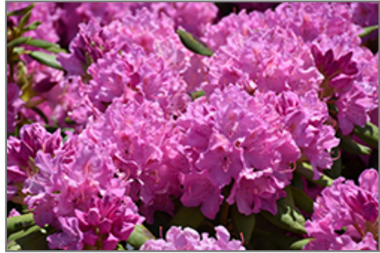
Roseum Elegans Rhododendron flowers