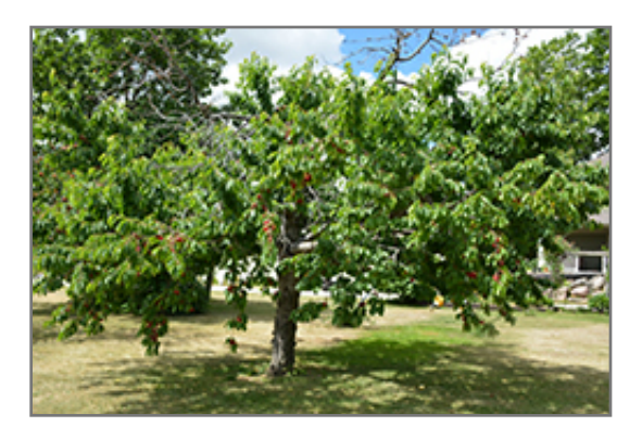
Bing Cherry fruit

This is a deciduous tree with a shapely oval form. Its average texture blends into the landscape, but can be balanced by one or two finer or coarser trees or shrubs for an effective composition. This plant will require occasional maintenance and upkeep, and is best pruned in late winter once the threat of extreme cold has passed. It is a good choice for attracting birds to your yard. Gardeners should be aware of the following characteristic(s) that may warrant special consideration;