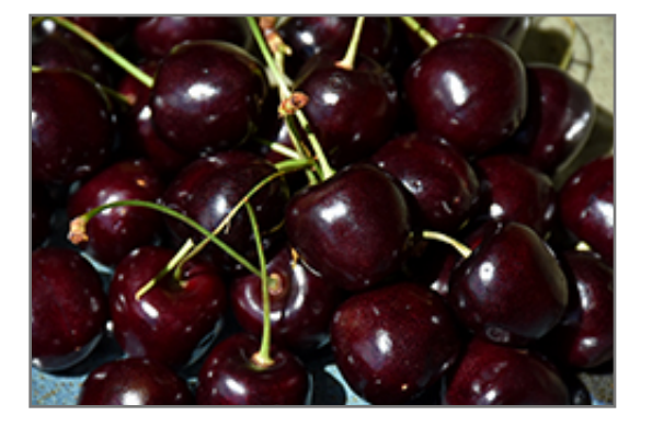
Bing Cherry fruit