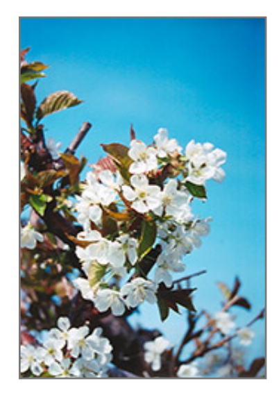
Bing Cherry flowers