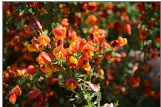
Lena Scotch Broom flowers