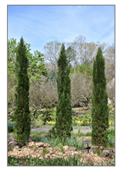
Blue Italian Cypress