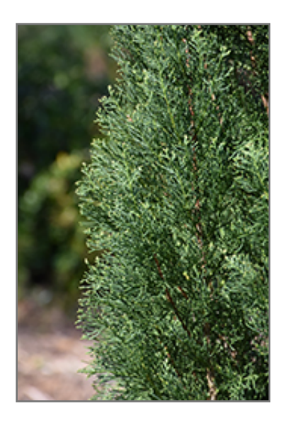
Blue Italian Cypress foliage