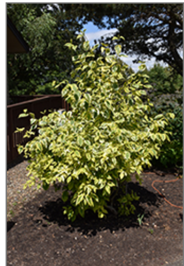
Hedgerows Gold Variegated Red-Twig Dogwood