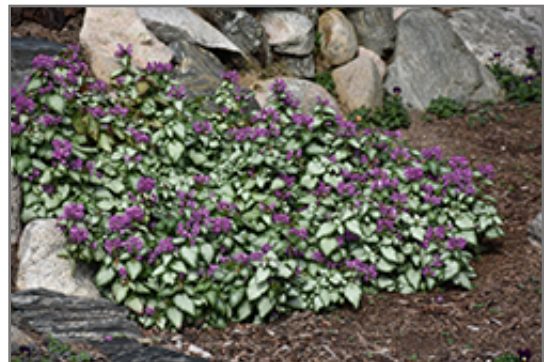
Purple Dragon Spotted Dead Nettle in bloom