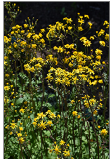
Golden Ragwort flowers