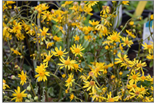
Golden Ragwort flowers