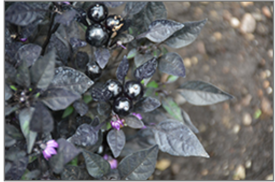
Onyx Red Ornamental Pepper fruit