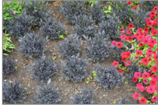
Onyx Red Ornamental Pepper

This plant will require occasional maintenance and upkeep, and should not require much pruning, except when necessary, such as to remove dieback. It is a good choice for attracting bees and butterflies to your yard, but is not particularly attractive to deer who tend to leave it alone in favor of tastier treats. It has no significant negative characteristics.