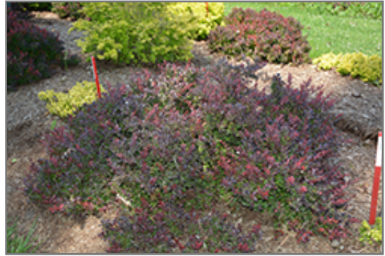
Sunjoy Todo Japanese Barberry

Sunjoy Todo Japanese Barberry will grow to be about 24 inches tall at maturity, with a spread of 24 inches. It tends to fill out right to the ground and therefore doesn't necessarily require facer plants in front. It grows at a medium rate, and under ideal conditions can be expected to live for approximately 20 years.