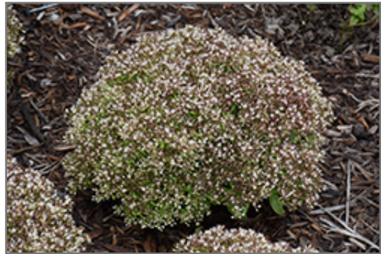
Rock 'N Round Bundle Of Joy Stonecrop in bloom