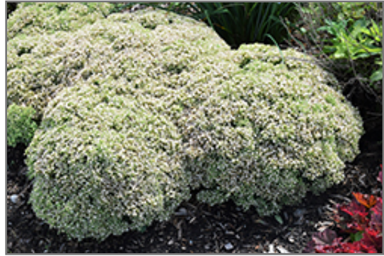
Rock 'N Round Bundle Of Joy Stonecrop in bloom

This is a relatively low maintenance plant, and is best cleaned up in early spring before it resumes active growth for the season. It is a good choice for attracting bees and butterflies to your yard, but is not particularly attractive to deer who tend to leave it alone in favor of tastier treats. It has no significant negative characteristics.