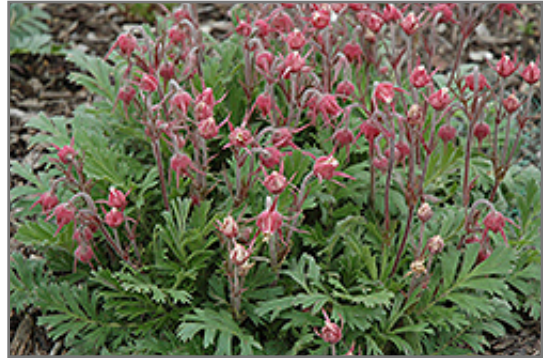
Prairie Smoke in bloom

This plant will require occasional maintenance and upkeep, and should be cut back in late fall in preparation for winter. It is a good choice for attracting butterflies to your yard, but is not particularly attractive to deer who tend to leave it alone in favor of tastier treats. Gardeners should be aware of the following characteristic(s) that may warrant special consideration;