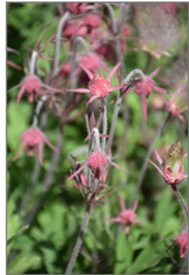
Prairie Smoke flower buds