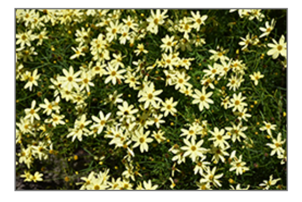
Moonbeam Tickseed flowers