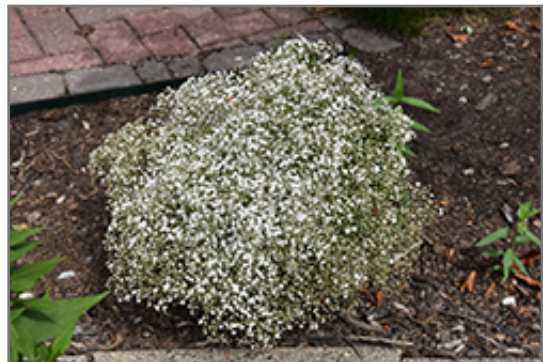
Summer Sparkles Baby's Breath in bloom