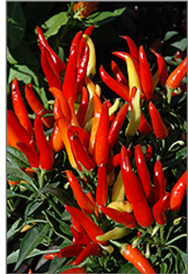
Chilly Chili Ornamental Pepper fruit

Chilly Chili Ornamental Pepper is an herbaceous annual with an upright spreading habit of growth. Its medium texture blends into the garden, but can always be balanced by a couple of finer or coarser plants for an effective composition.