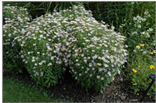
Blue Star Japanese Aster in bloom